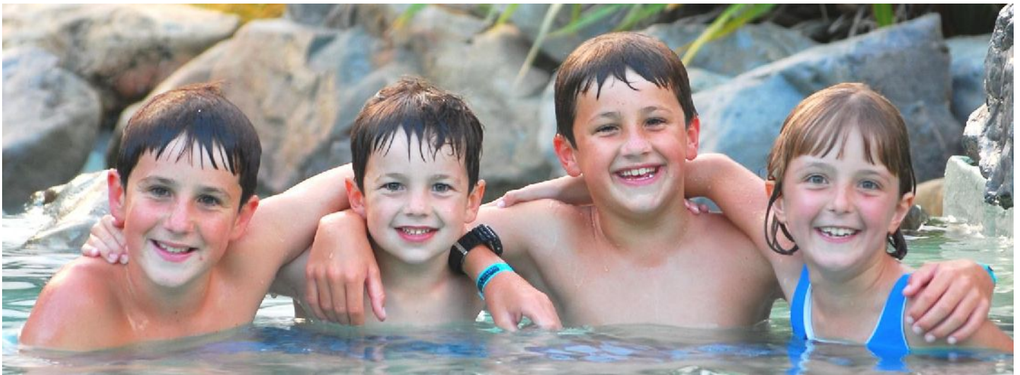
The boys in the pools at Hanmer Springs with their cousin from Blenheim.