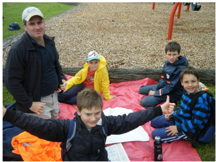
My small group of boys.

Please pray that God will continue to transform the lives of the campers as they have returned home with a new understanding of who He is. Also give thanks for the leaders and all they give up to serve at SUPAKidz camps. And pray that God will use the talents and skills that they have developed at camps in their churches and communities.